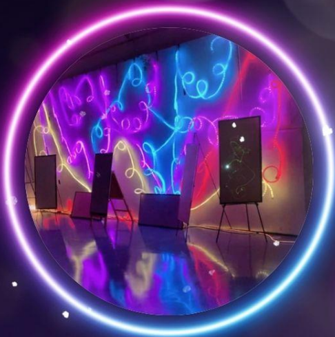
The Glow Gallery